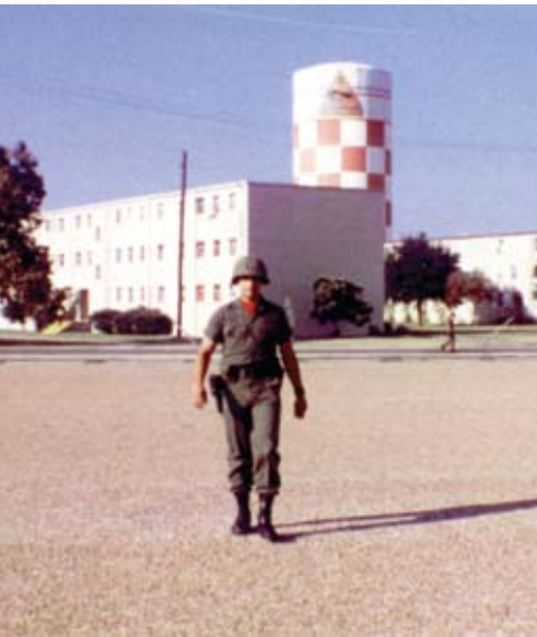
2LT Moe Rivera in Fort Hood, Texas, 1981.

to serve Him at a local church in southwest Houston.