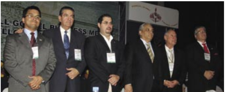
We give thanks to the Panama FGBMFI leadership and their warm hospitality.