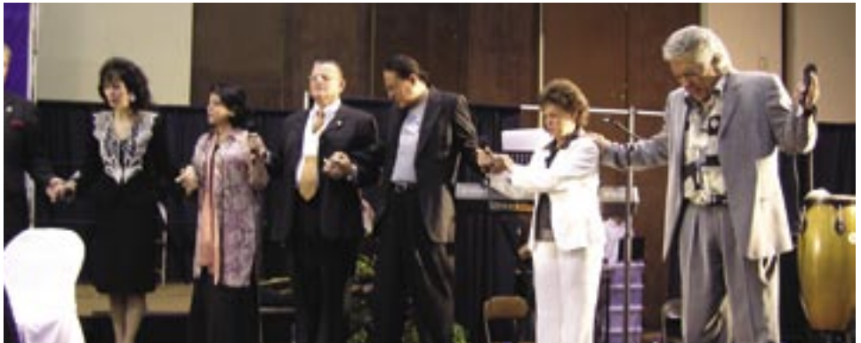
The six main song stylists worship together at the World Convention.